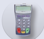
VeriFone PP 1000SE