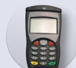
Spectra In-Lane Terminal