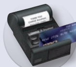
Bluetooth Card Swiper / Receipt Printer