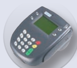
Ingenico i6580/i6780 (Sig Capture)