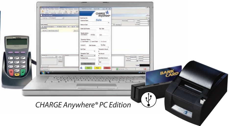
CHARGE Anywhere ® PC Edition